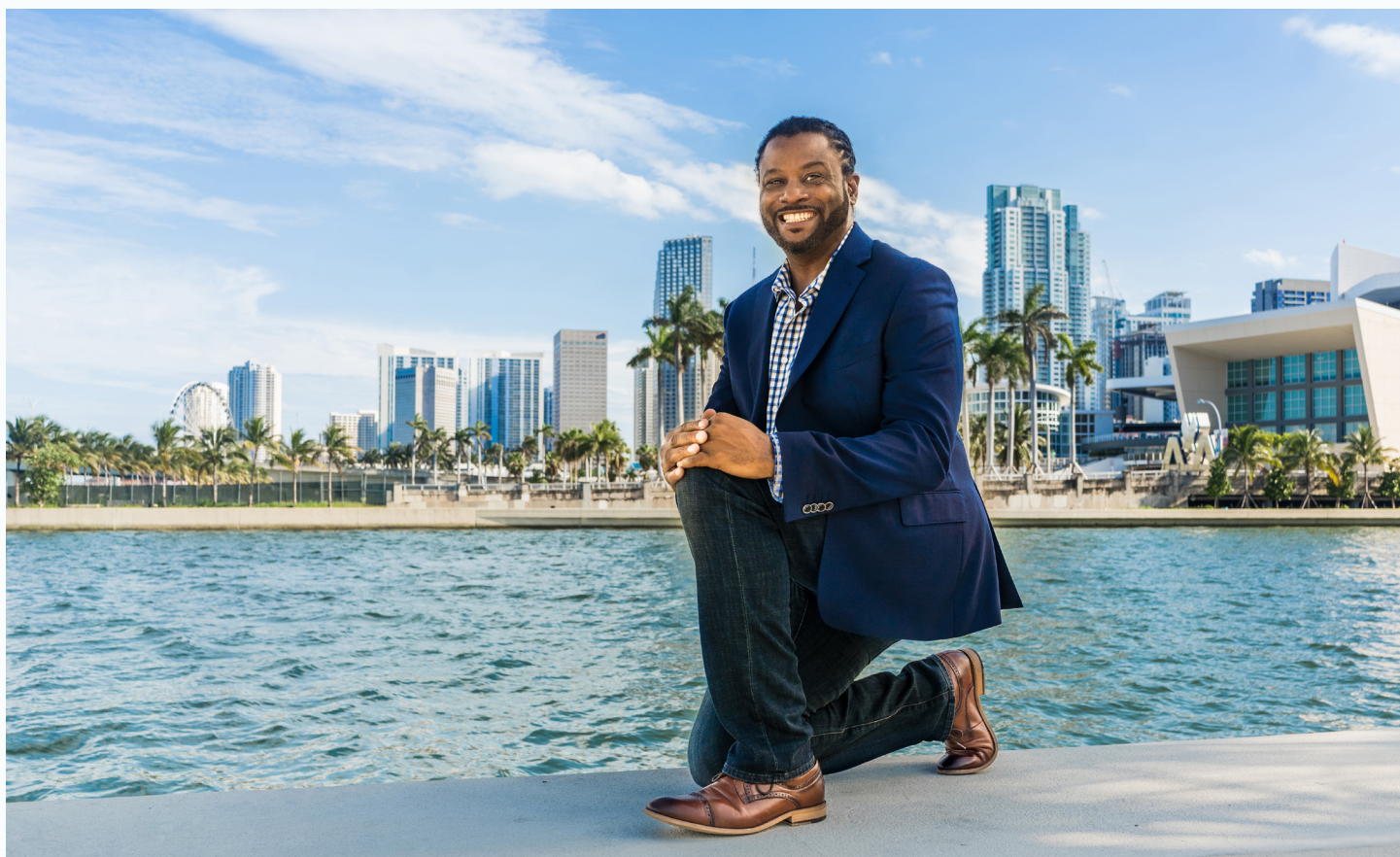
Museum Park Downtown Miami