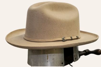
CUT BRIM - PENCIL EDGE