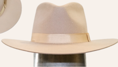
TEAR DROP CROWN