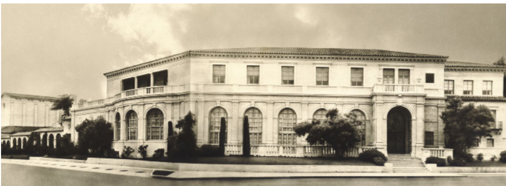
Ebell of Los Angeles, Wilshire Boulevard, 1933

One of Los Angeles’ Historical Treasures designed by architect Sumner Hunt, and built in 1927, The Ebell’s historic campus commemorates nearly 100 years on LA’s famed Wilshire Boulevard. With three levels and more than 75,000 square feet, the Italian renaissance-inspired structure is a noted architectural treasure listed on the National Register