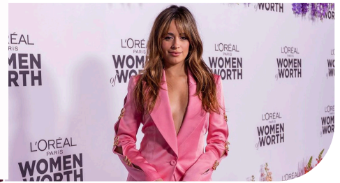
L'Oréal Women of Worth

of Historic Places and a designated Los Angeles Cultural Monument. The campus includes a grand dining room, art salon, courtyard garden, lounge, and 1238-seat Broadway-style theatre.