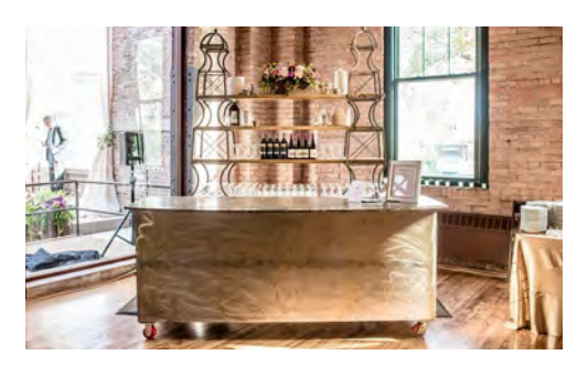
2 Metal Bars