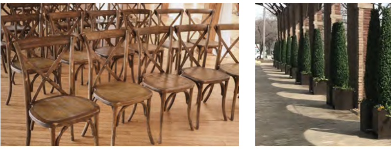
French Country Chairs