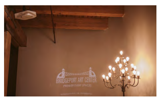
2 Video Mapping Projectors