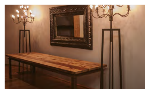
Rustic Wood Table