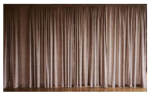
Pipe and Drape