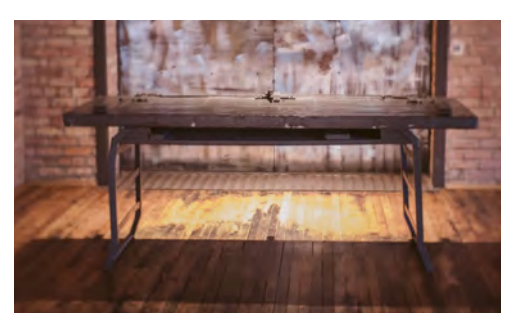
Fire Door Table