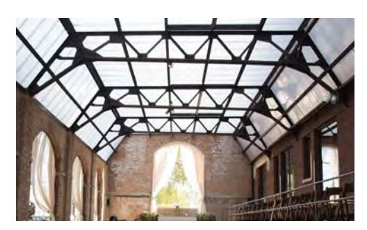
Garden enclosure / Archway seal