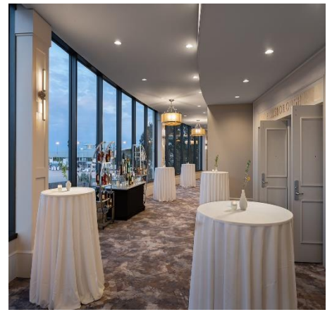
HILLSBOROUGH BALLROOM PRE-FUNCTION SPACE RECEPTION