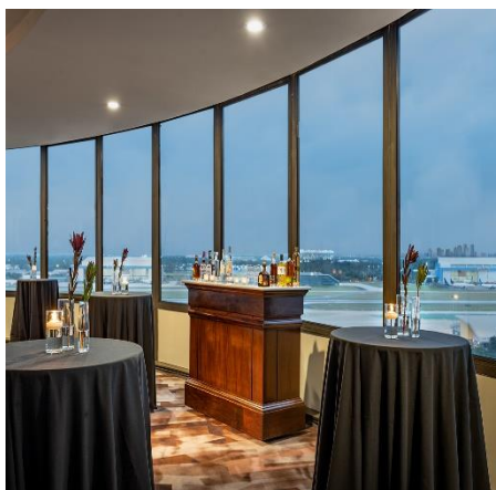
THE VIEW RECEPTION