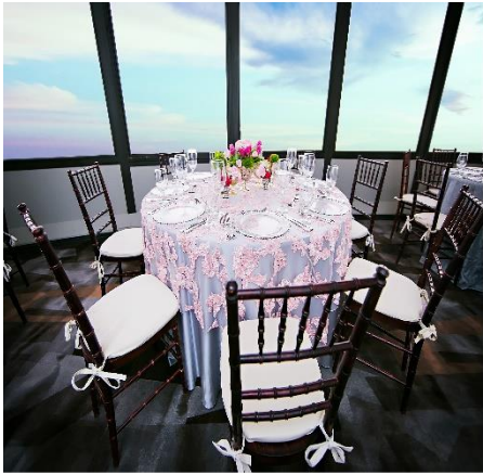
THE VIEW WEDDING RECEPTION SETUP