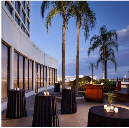
PATIO COCKTAIL RECEPTION