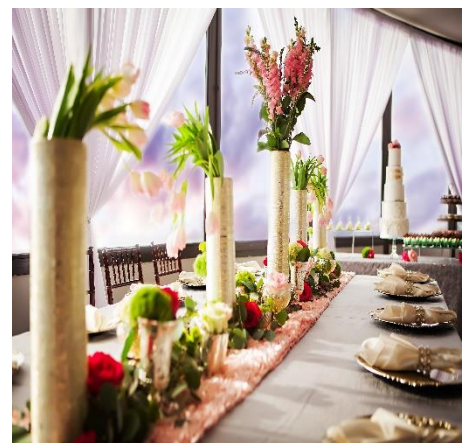
THE VIEW RECEPTION SETUP