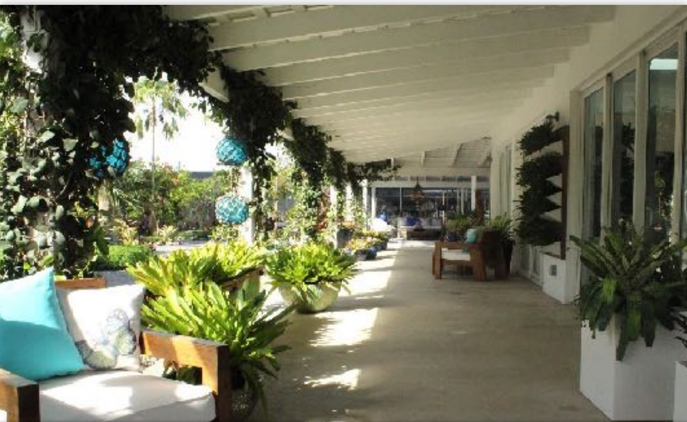
ADDITIONAL COVER AREA