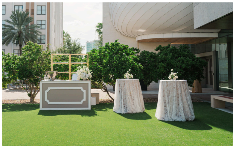
Green Pearl Photography