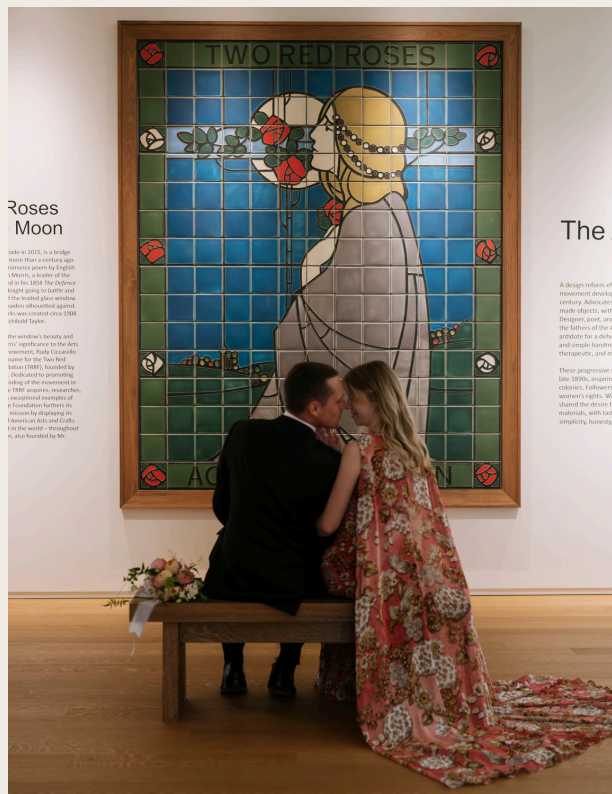
The Hello Photo

OUR MISSION: TO OFFER EXCEPTIONAL SERVICE AND TRULY GENUINE HOSPITALITY WHILE SHOWCASING NEW PERSPECTIVES AND POSSIBILITIES TO ALL GUESTS.