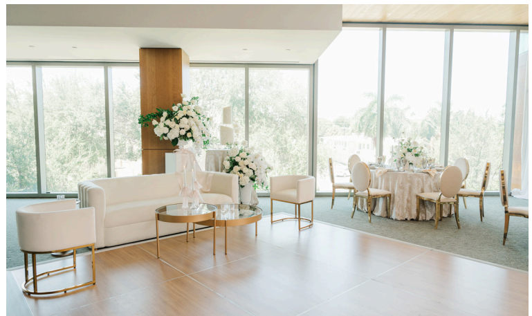
Green Pearl Photography