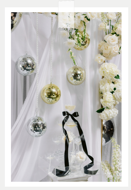
Every moment, big or small, should be celebrated to the fullest.

At the heart of Blissfully Styled Milestones is the belief that the milestones of your life deserve to be celebrated in a way that is meaningful and memorable.