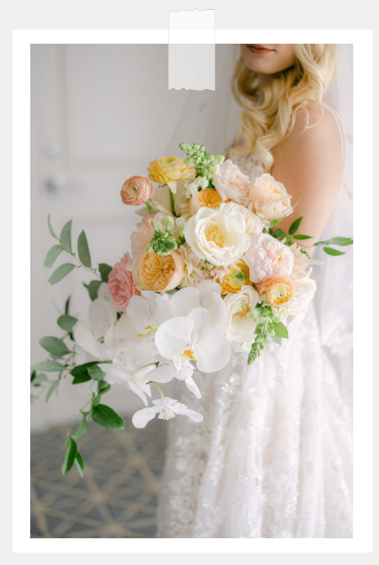
Imagining more than a single day of celebration? Extend your wedding celebration throughout the weekend!

Greet your guests with a welcome dinner or relive the big party's memories and say farewell at a fabulous brunch with your loved ones.