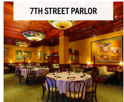
7TH STREET PARLOR