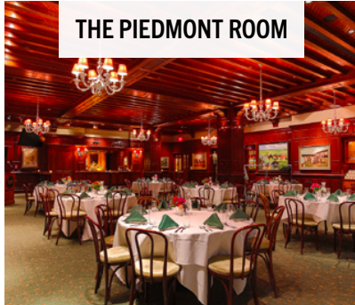
THE PIEDMONT ROOM