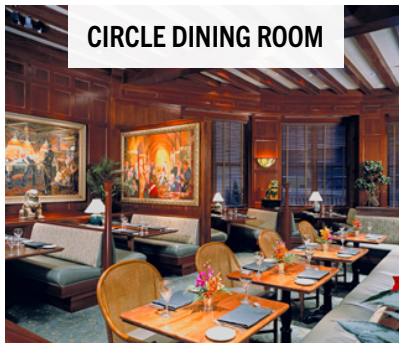
CIRCLE DINING ROOM