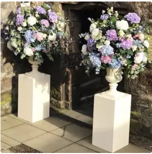
Large flowers as backdrop