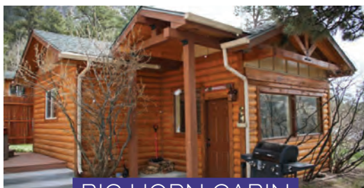
BIG HORN CABIN

King Bed | 1 Bedroom | Hot Tub | Fireplace | Open Floor Plan | Fully Equipped Kitchen | Wood Burning Stove | Satellite TV and DVD