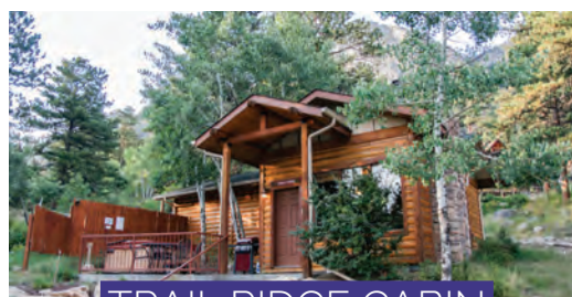
TRAIL RIDGE CABIN

2 Queen Beds | 1 Bedroom | Hot Tub Fireplace | Open Floor Plan | Fully Equipped Kitchen | Wood Burning Stove | Satellite TV and DVD