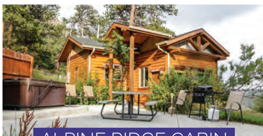
ALPINE RIDGE CABIN