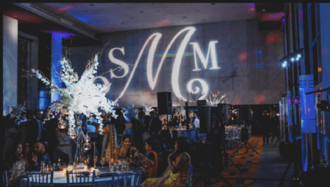
Custom Monogram Displays