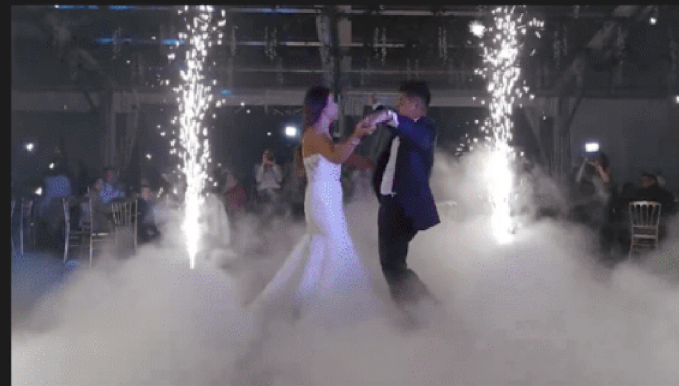
Cold Sparklers & "The Cloud"