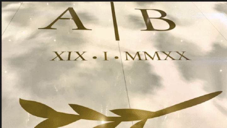
Custom Vinyl Dance Floor Wraps