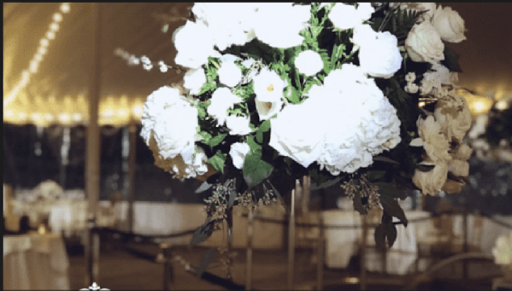
Pine Spot & String Lighting