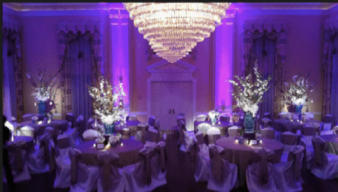
Uplighting & Pin Spot Lighting