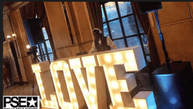
New: Lighted Letter Displays