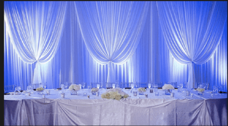
Curtain Panel Backdrops