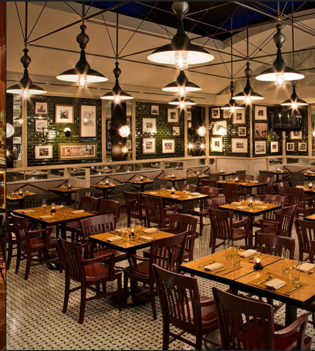
CITIZENS KITCHEN + BAR