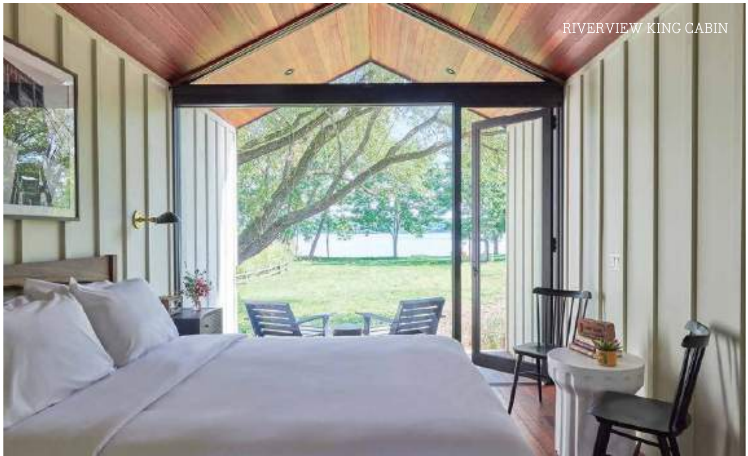
RIVERVIEW KING CABIN