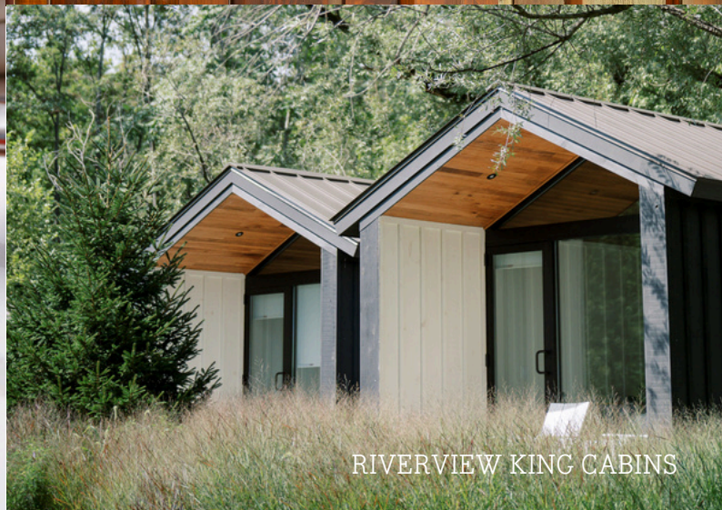
RIVERVIEW KING CABINS