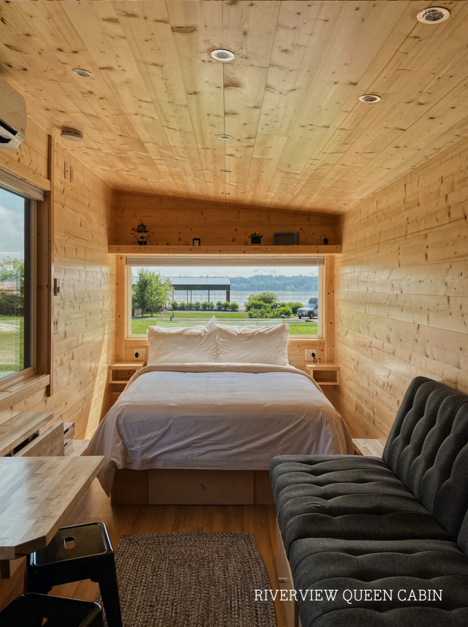
RIVERVIEW QUEEN CABIN