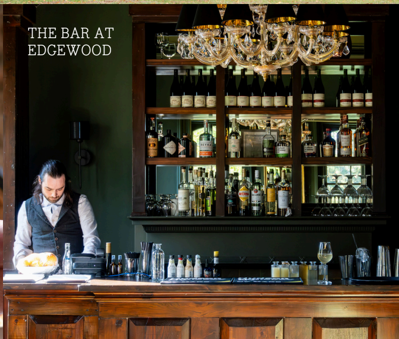
THE BAR AT EDGEWOOD