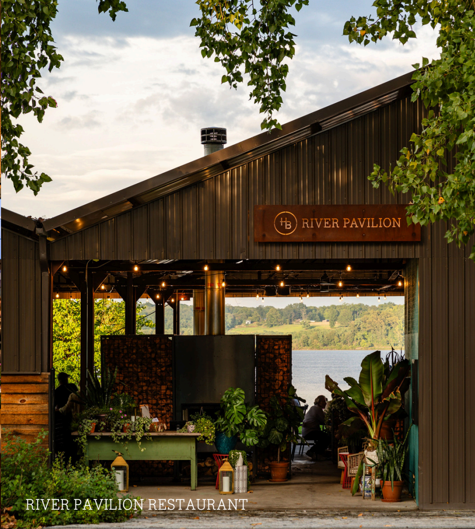
RIVER PAVILION RESTAURANT