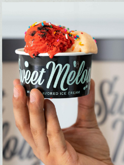
Sweet Melody Ice Cream