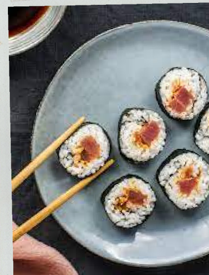
Maki San – sushi