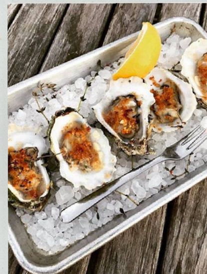
The Shores – Oyster Bar