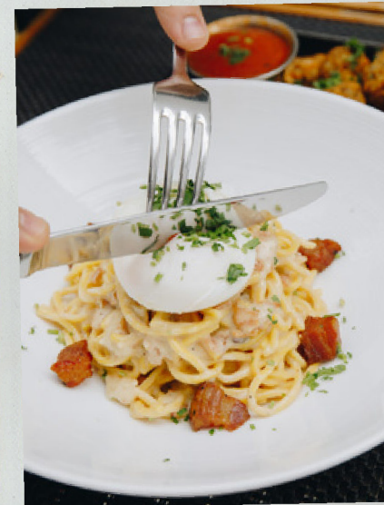
Borti – Pasta Bar