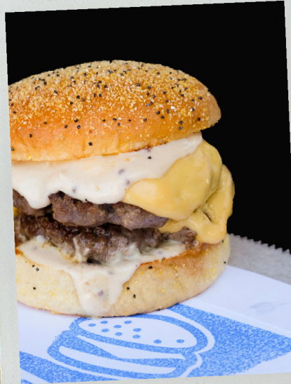
USBS – burgers