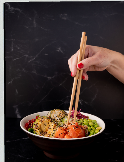
Poke San – Poke Bowls

12 curated vendors are here to satisfy any craving!