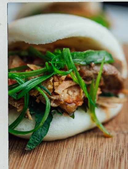
Pho Sho – Modern Asian