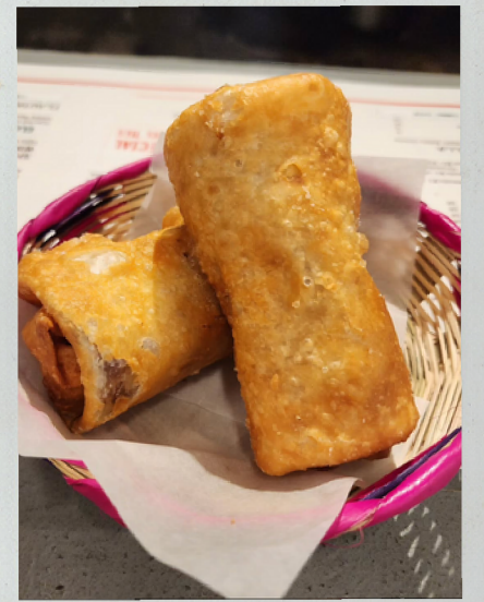
Gueritos – Tex-Mex