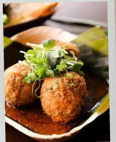
Manjay – Caribbean