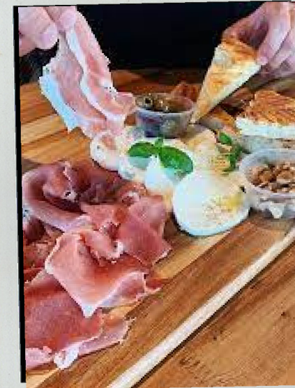
Borti Bottega- charcuterie