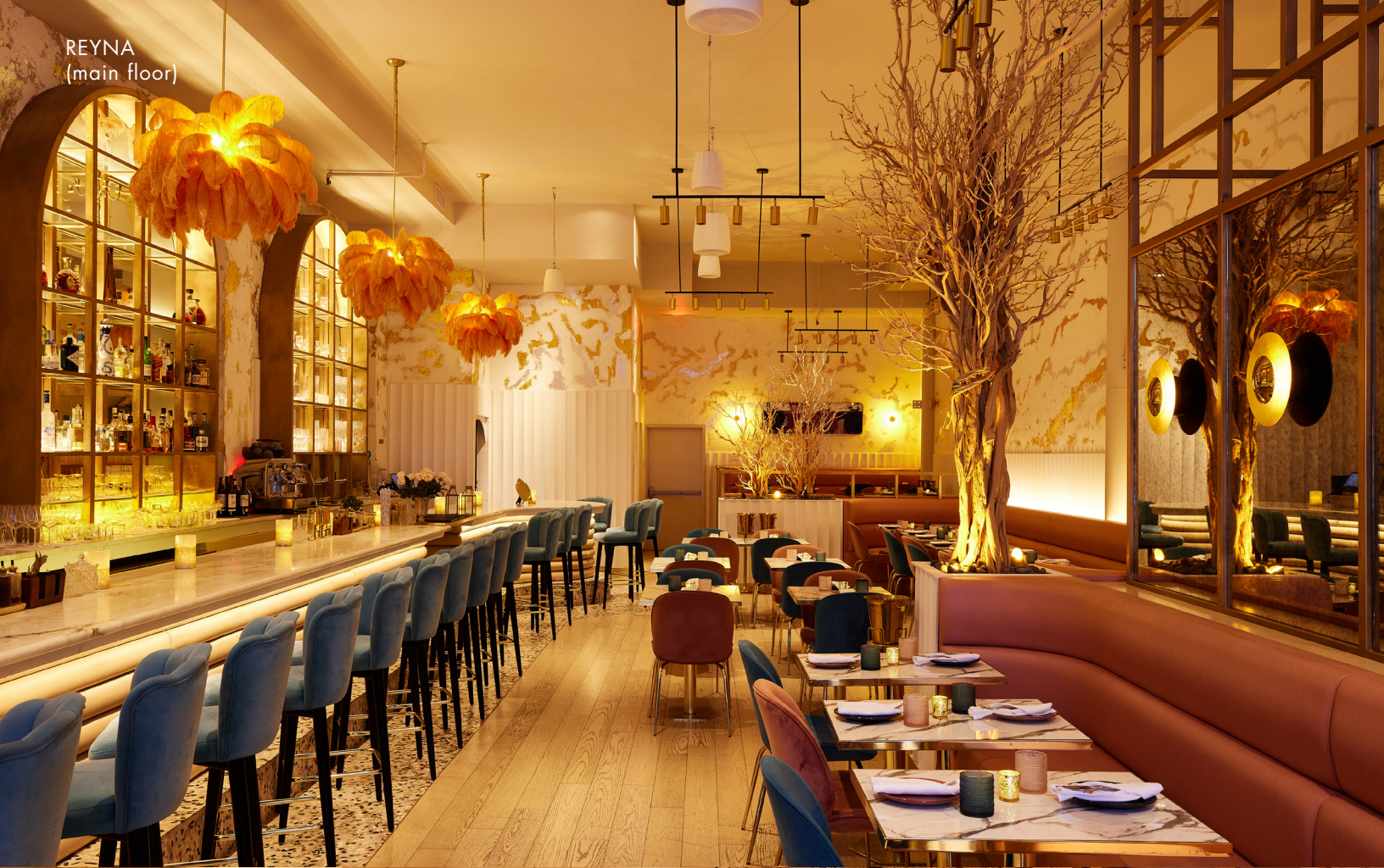
REYNA (main floor)