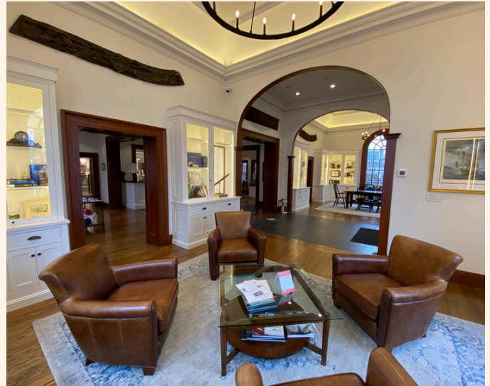
Front library and entrance foyer