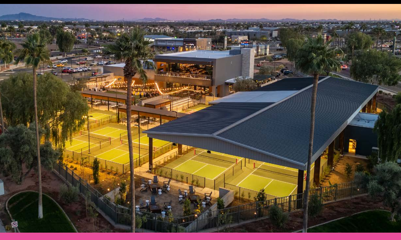
SO YOU WANT TO THROW A KILLER PARTY?

If you've found it hard to decide between the private spaces at electric pickle, then why decide at all. why not have the whole thing. Our house truly becomes your house with the Full Monty. Be the ultimate host by throwing the ultimate event.