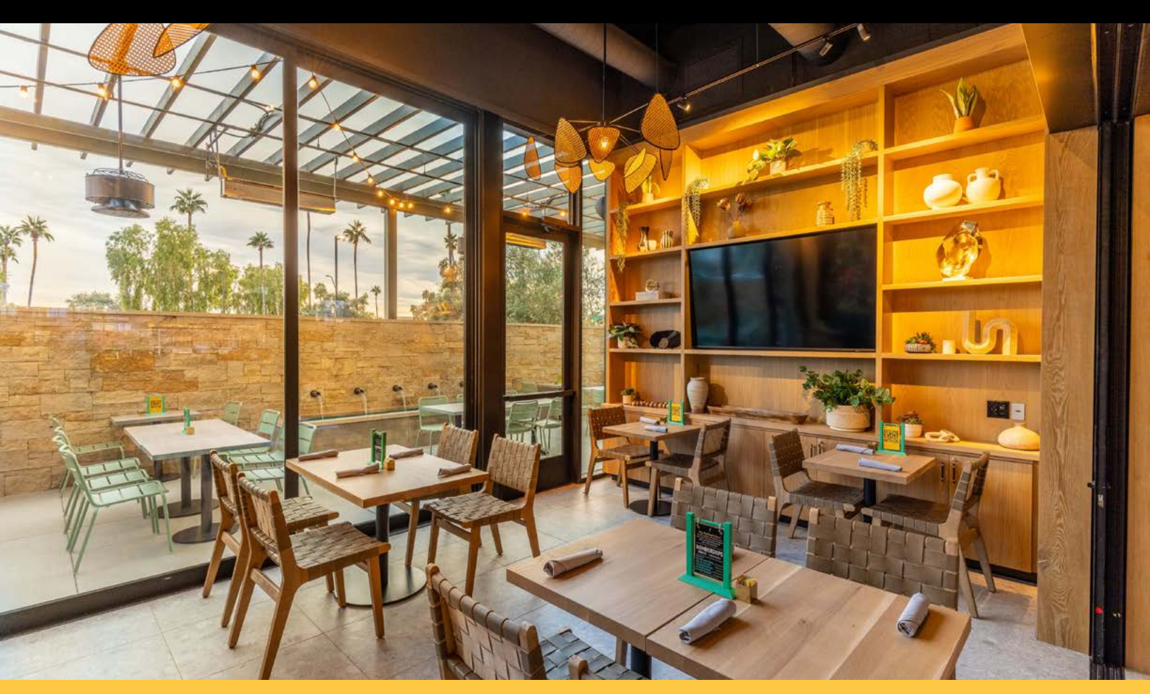
SO YOU WANT TO THROW A KILLER PARTY?

Located downstairs, adjacent to our main dining room, The Ace Room can be separated from the general public with sliding glass doors that give you the privacy you need for your party while allowing you to feel connected to the ambience of the venue. The Ace Room has a TV for sporting events or Audio/Visual presentations. Perfect for small to mid-size parties of any kind.