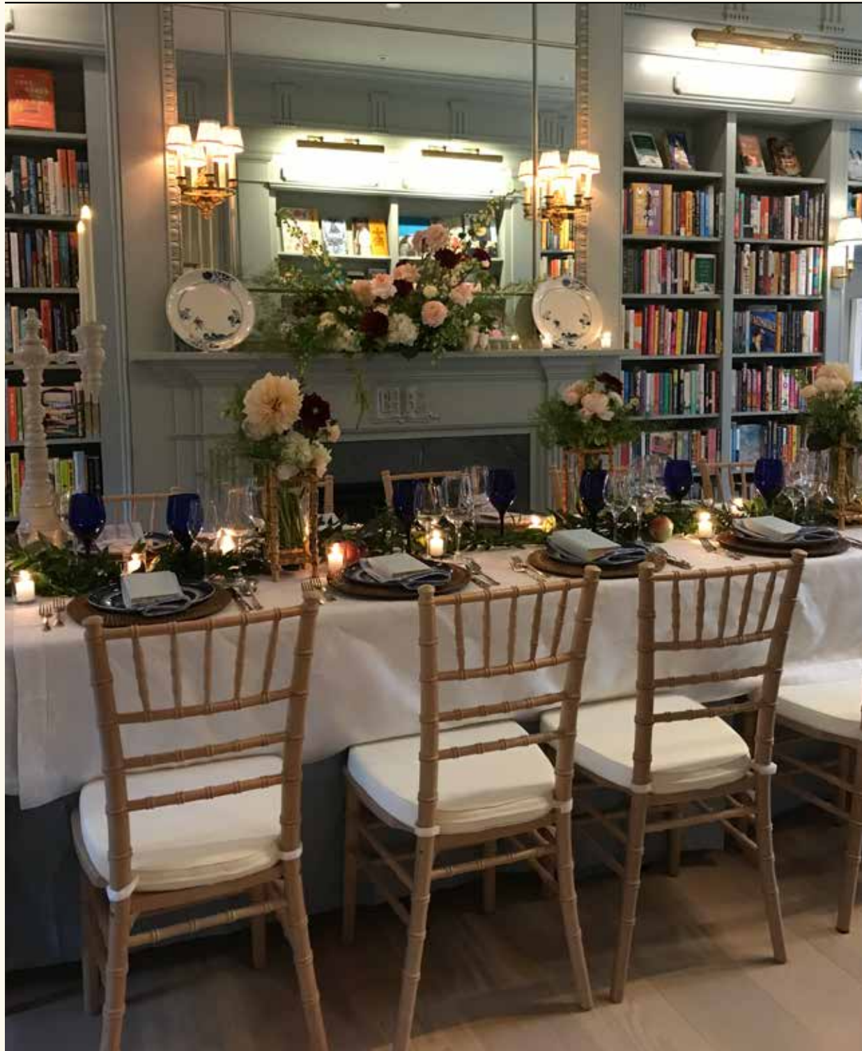
Beacon Hill Books & Cafe