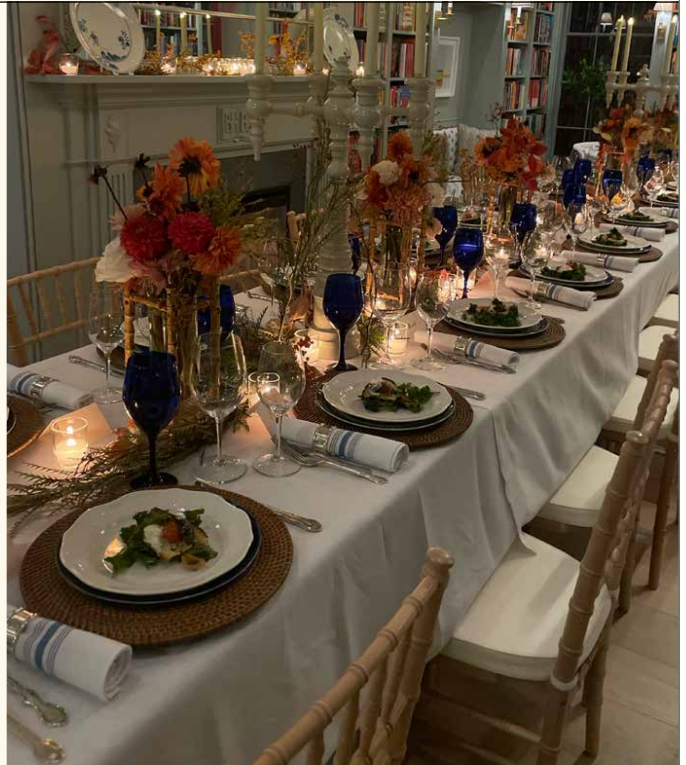
Private Events 2025 | II