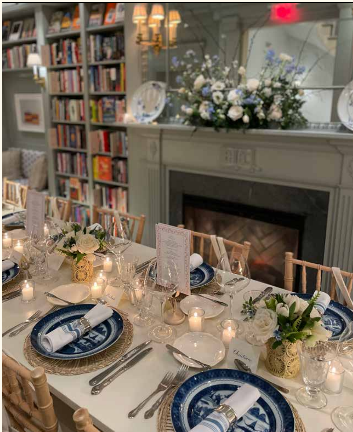
Beacon Hill Books & Cafe