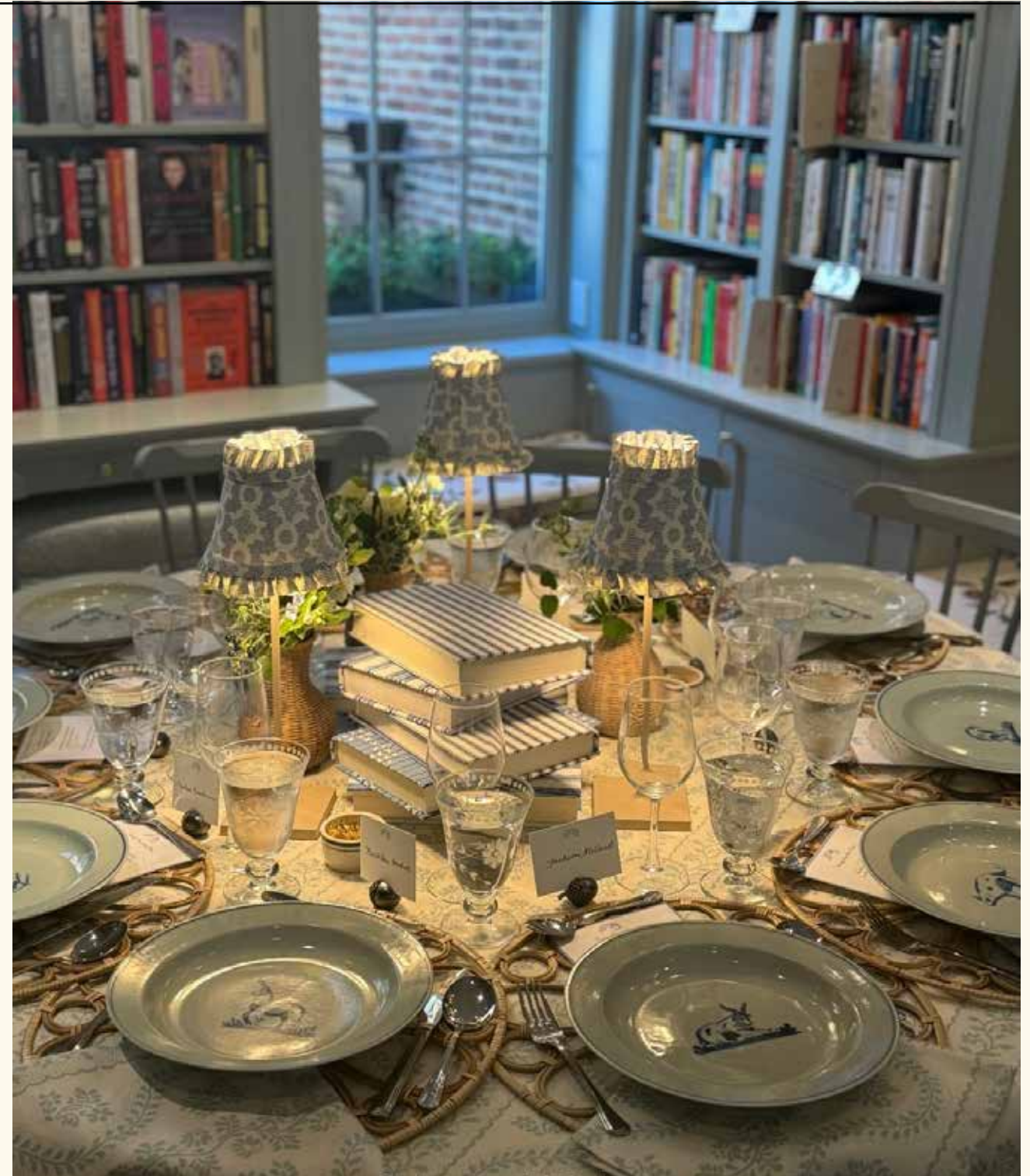
Private Events 2025 | 10