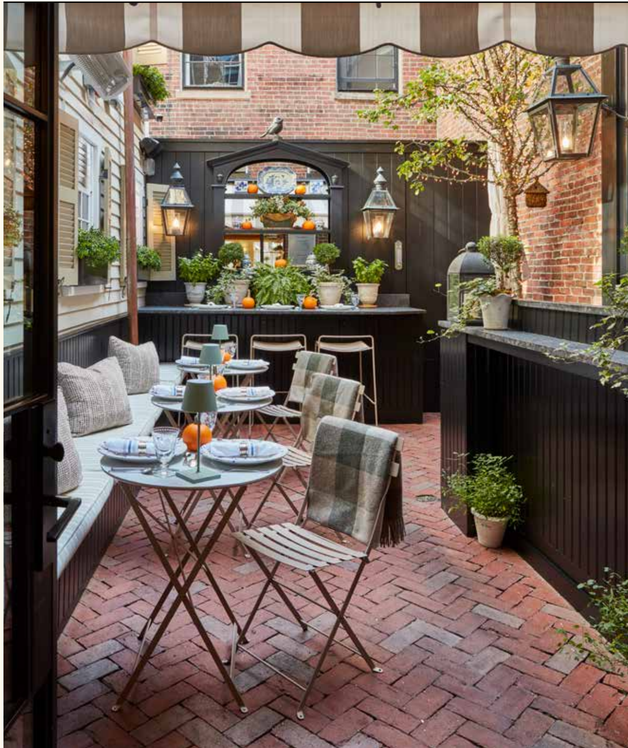
Beacon Hill Books & Cafe