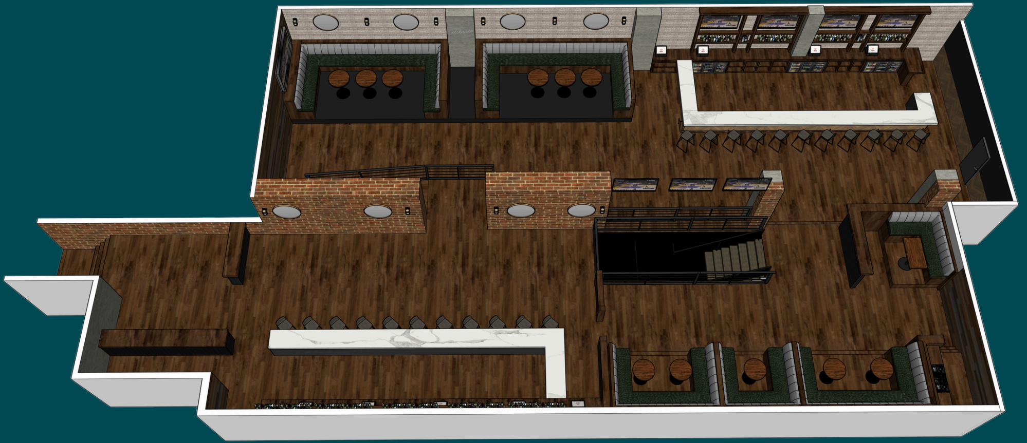
MAIN FLOOR- UPPER LEVEL