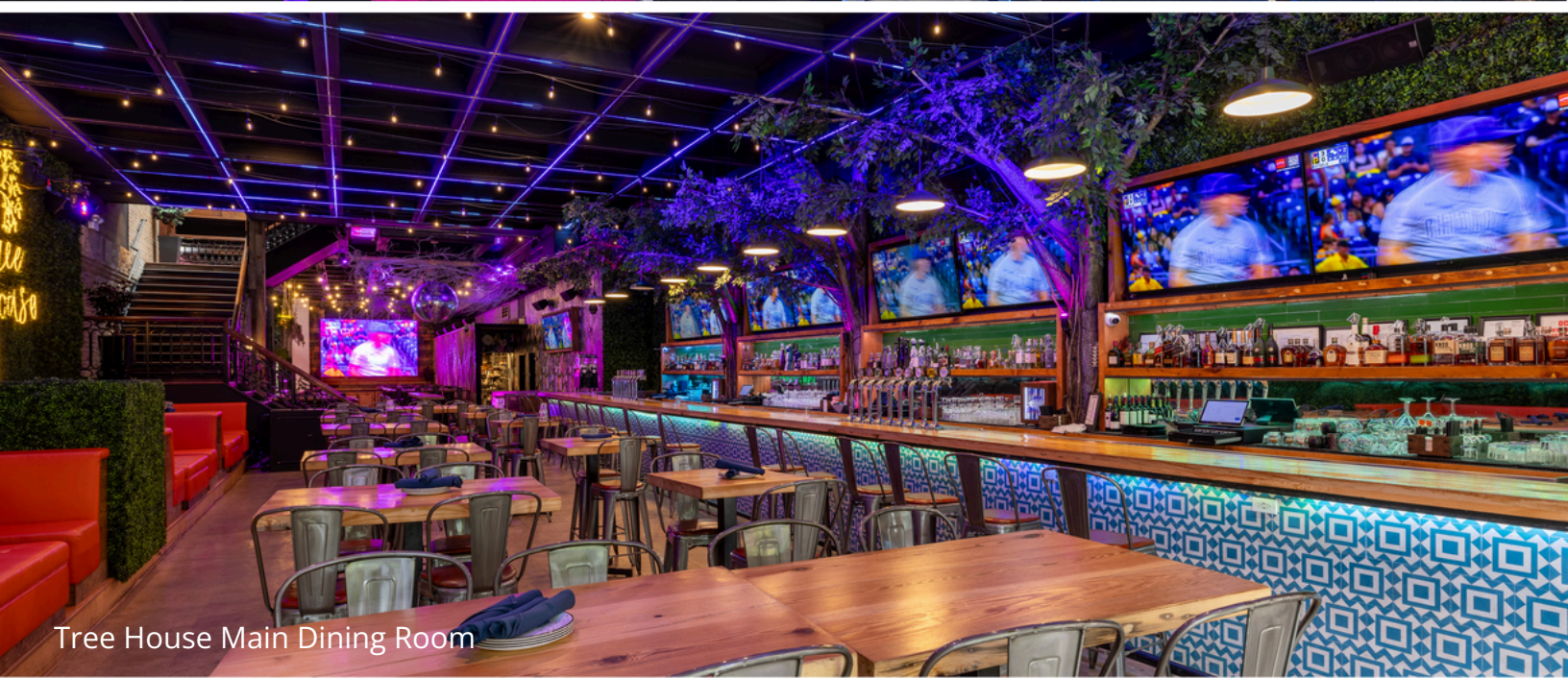
Tree House Main Dining Room