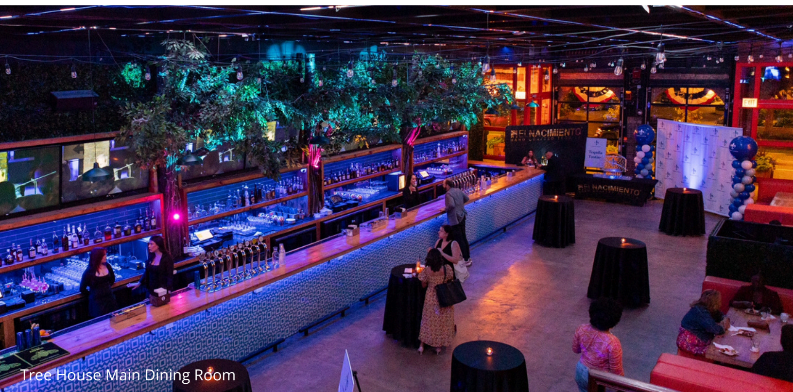
Tree House Main Dining Room

All spaces are priced for an event up to 3 hours of service. If you wish to increase the timeline of your event please contact the event manager for pricing information. All guests are guaranteed access to the space 30 minutes prior to the event for setup. Guests will coordinate any setup requests and timeline for the event in advance with the event manager to facilitate a successful event.