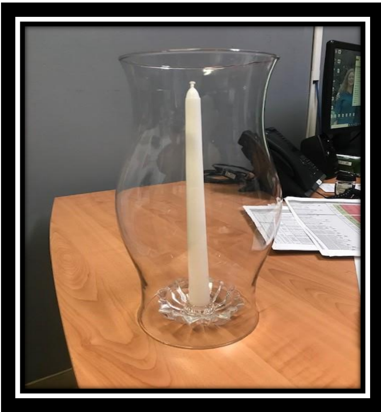
50 Hurricane Globes Client to provide taper candles