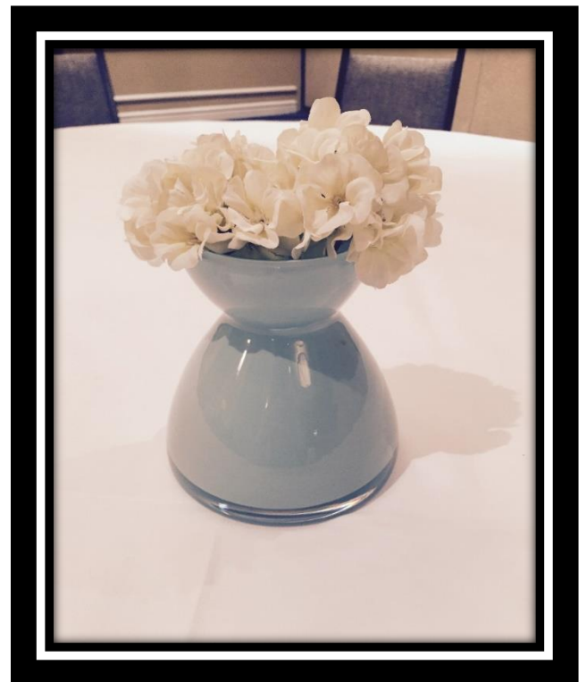
6 Small Blue Vases