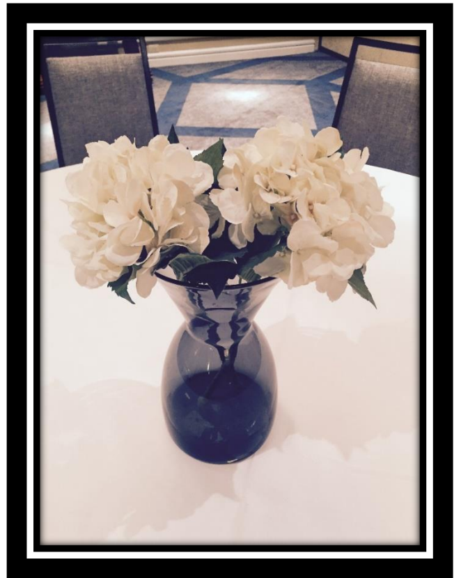
10 Grey Vases