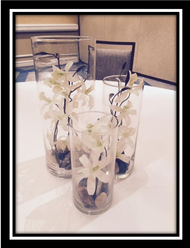
25 Tall Cylinders 10 Medium Cylinders 15 Small Cylinders