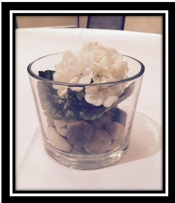
5 Short/Wide Cylinders