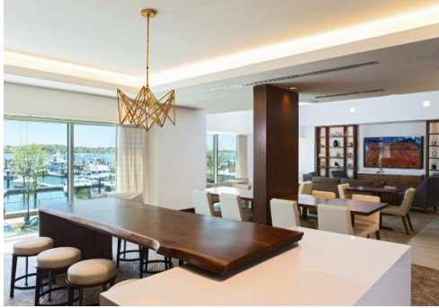
M CLUB LOUNGE