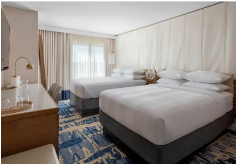
DOUBLE QUEEN ROOM