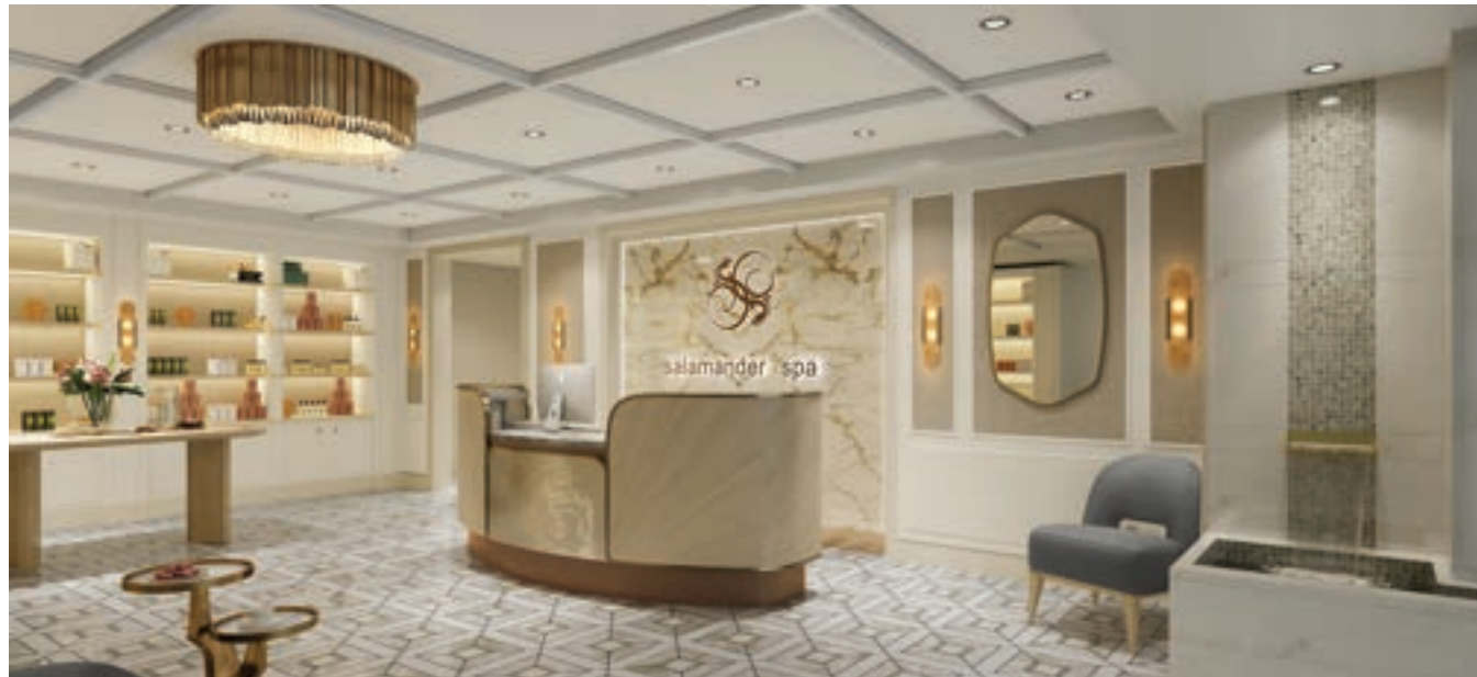
Guests are welcomed with a relaxing retail reception area, enhanced with light and rejuvenating touches.