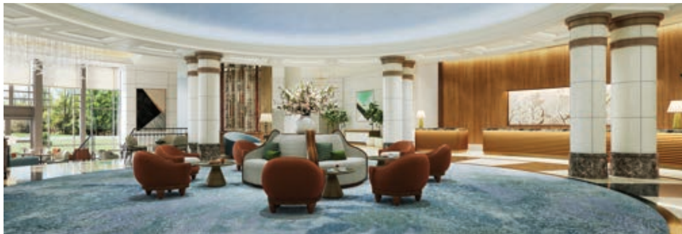
Led by New York based studio, Champalimaud Design, our new Lobby and Lounge offer Salamander-inspired touches.

Bathed in natural light, the newly enhanced Lounge overlooks our tranquil Grand Lawn and Lounge Terrace, offering a modern and inviting space. Expanded seating and comfortable dining areas blend style with comfort, while a sophisticated stone-top bar serves as a striking centerpiece. This airy yet intimate environment invites guests to unwind and enjoy exquisite dining options, including our seasonal Afternoon Tea experience.