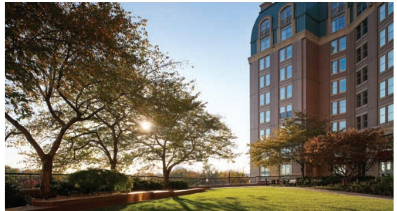
Enjoy a peaceful stroll in our tranquil Grand Lawn, curated by the international landscape architecture and urban design company, OCULUS.