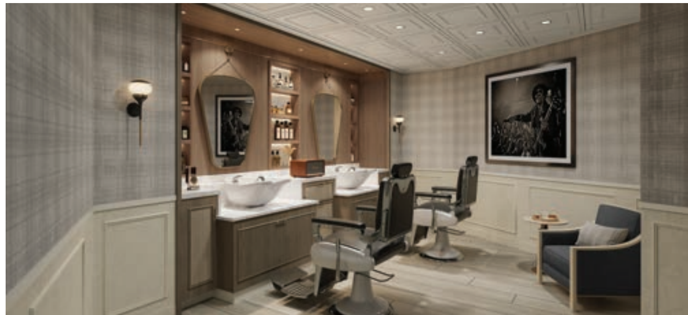
Gentlemen can elevate their experience with the Groom Guy Lounge, offering a refined blend of luxury and style.