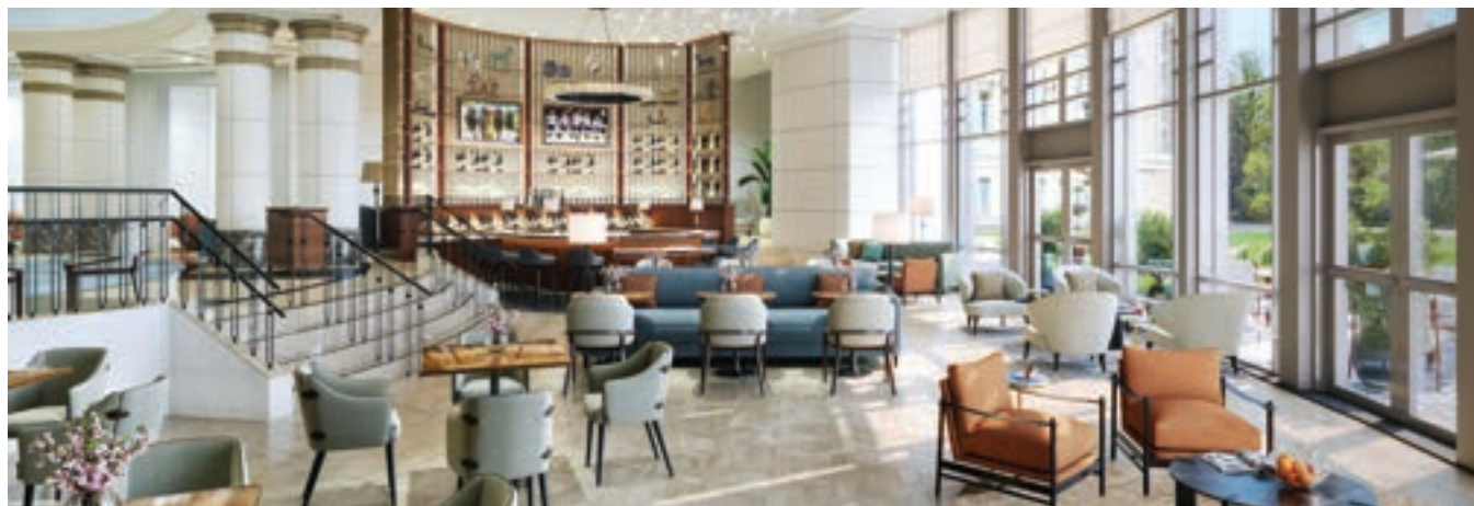
The Lobby seamlessly flows into a refurbished Lounge featuring a sophisticated stone-top bar.