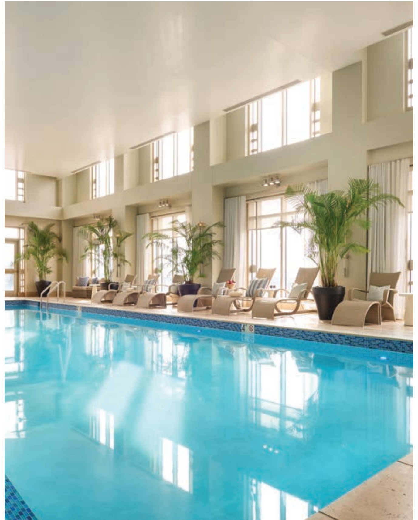
Our 40-ft. heated indoor pool is a true gem in the district. A peaceful retreat for relaxation and family fun. Open daily from 6:30 am to 10:00 pm for hotel guests confirmed for overnight stays, it offers the perfect setting for a refreshing swim or quality time together.