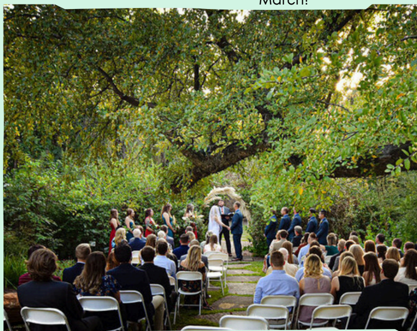
Outside Wedding Court Lower Gardens (Up to 300 Seats)