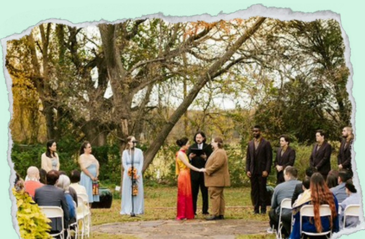
Formal Gardens Semi-Circle (Up to 150 Seats)