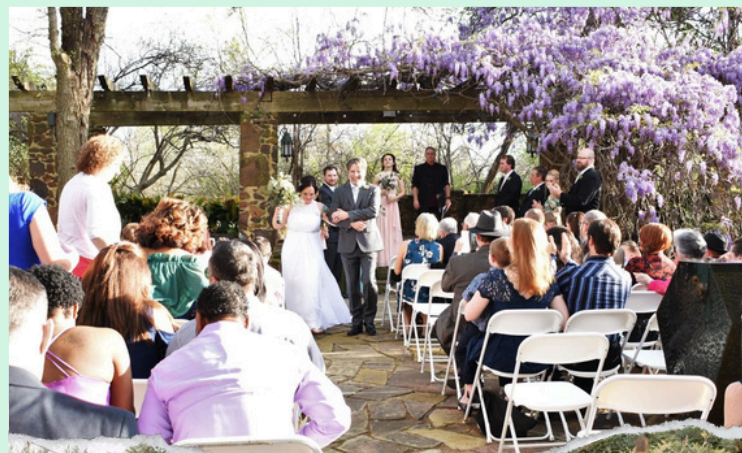
Wisteria (Up to 175 Seats) Fun Fact: It blooms purple one week in March!