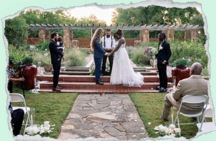
Formal Gardens T-Shaped Pond (Up to 300 Seats)