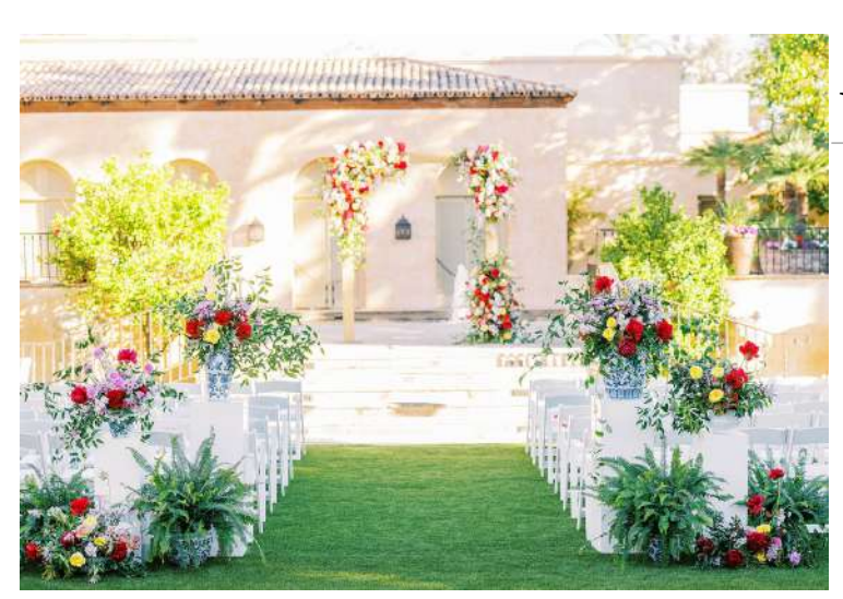
pairs with reflecting pool | estrella salon