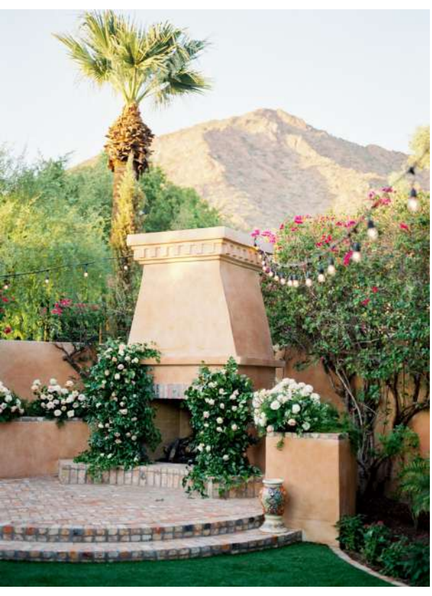
pairs with reflecting pool | estrella salon