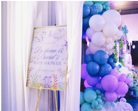
10FT BALLON GARLAND (2 COLORS)