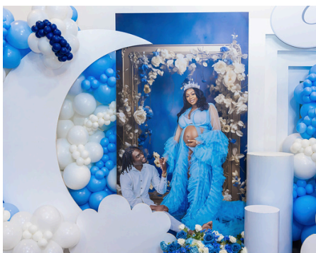
CUSTOM PRINTED BACKDROP