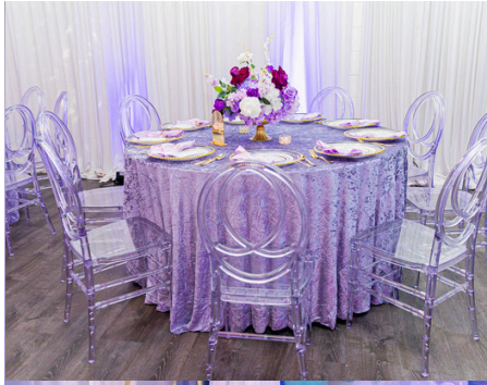
GHOST CHAIR RENTAL