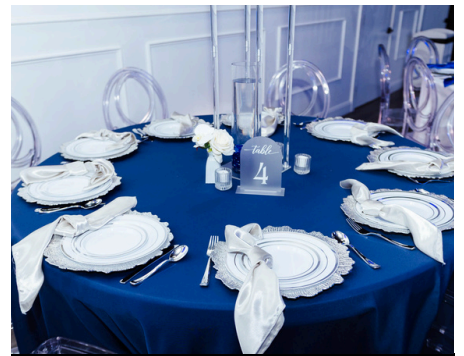
COLORED TABLE LINEN