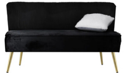
SPECIALITY SEATING RENTAL