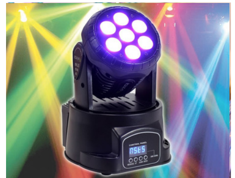
MOVING HEAD / PARTY LIGHTS