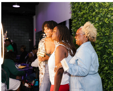
DIGITAL SELFIE BOOTH RENTAL