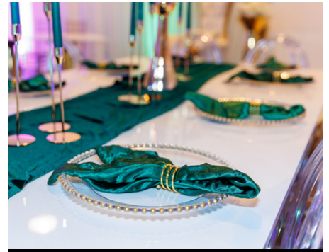
ADDITIONAL SETUP TIME