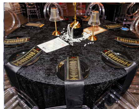
VELVET TABLE LINEN