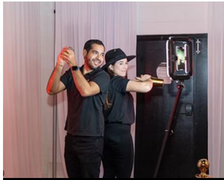
360 PHOTOBOOTH RENTAL