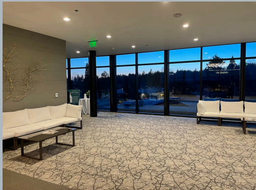
Executive Suite 600 sq feet