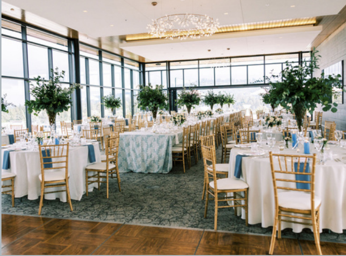
Ironlight 4000 sq feet