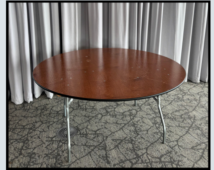
60" Round Table 18 available