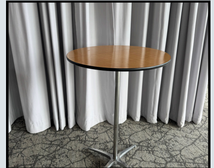
30" cocktail table 15 available