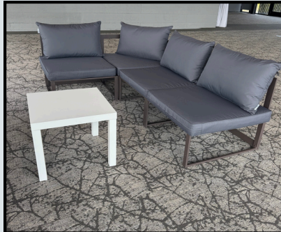
Soft Seating 13 modular pieces available