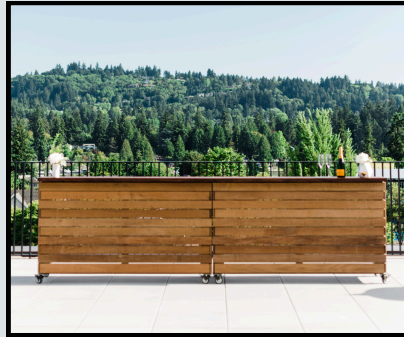
Mobile Bar Front Two 6' bars available