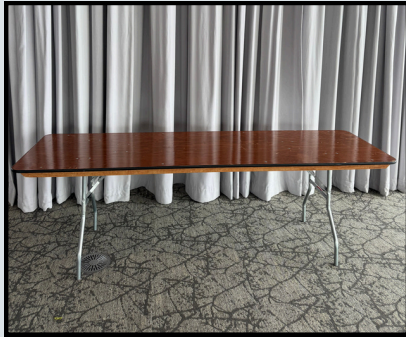
8' x 30" tables 210 available