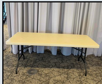
6' x 30" tables 7 available