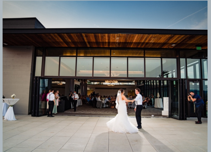
Hood Terrace 2300 sq feet