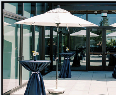
Cafe Umbrellas 8 available *Set up fee may apply