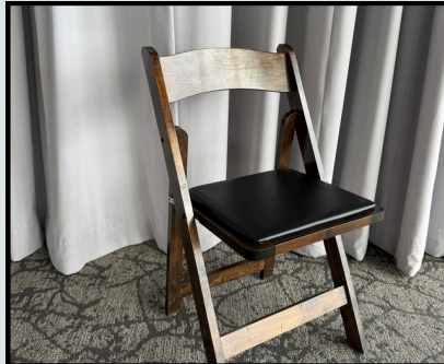
Fruitwood Chairs 240 available