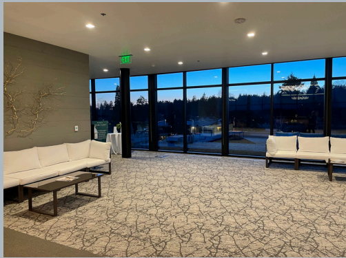
Executive Suite 600 sq feet