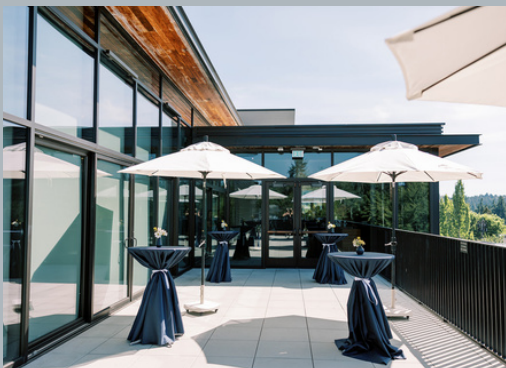
Ironlight Lobby 1000 sq feet