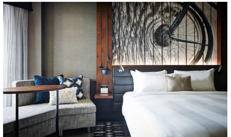
DELUXE KING ROOM