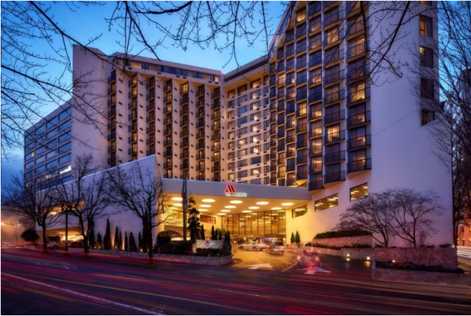
HOTEL STREET VIEW