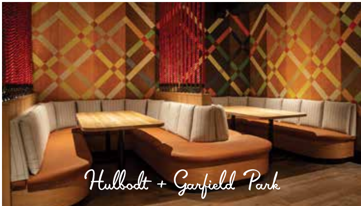
Humboldt + Garfield Park