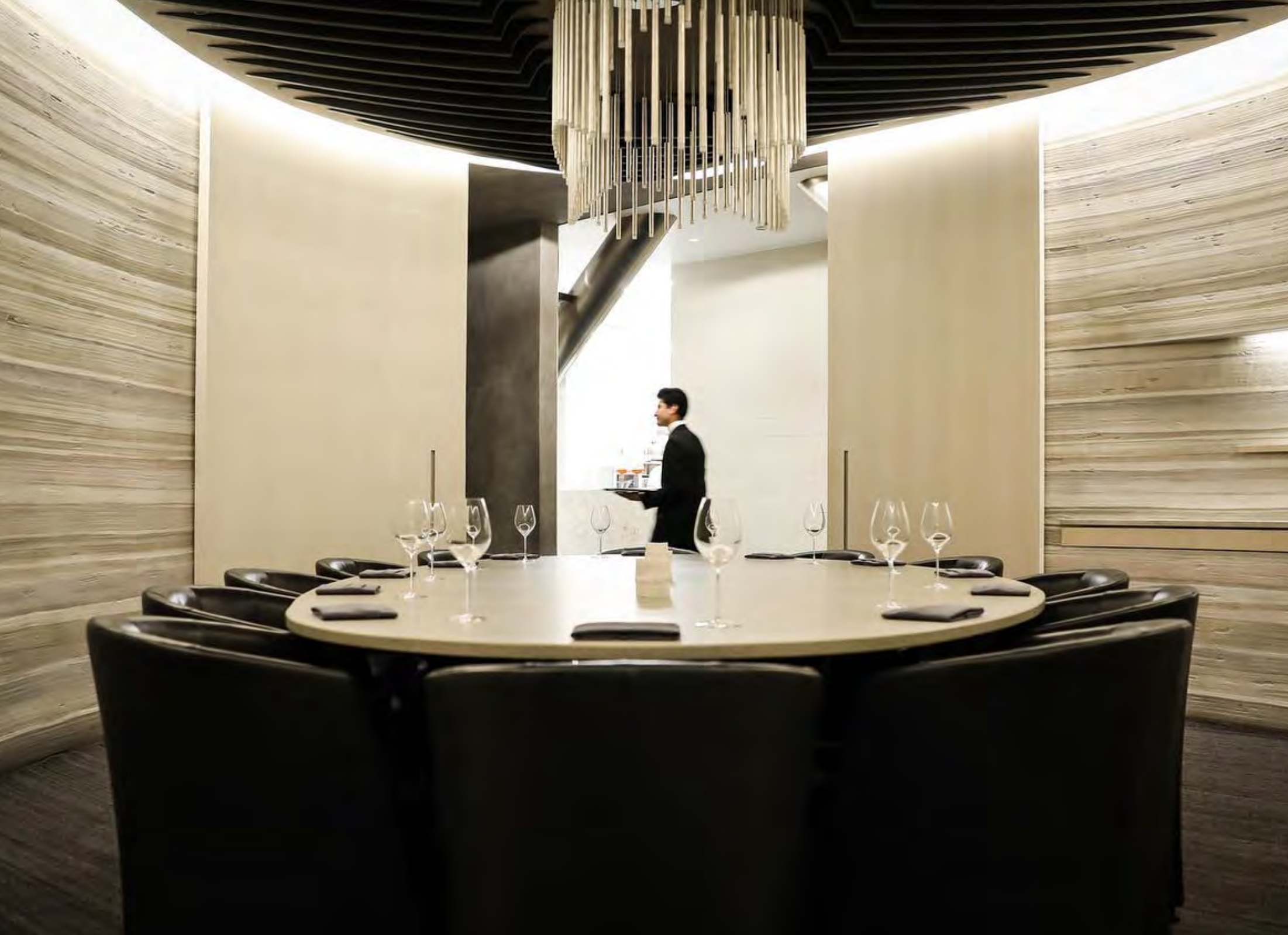
Ever's Private Dining Room