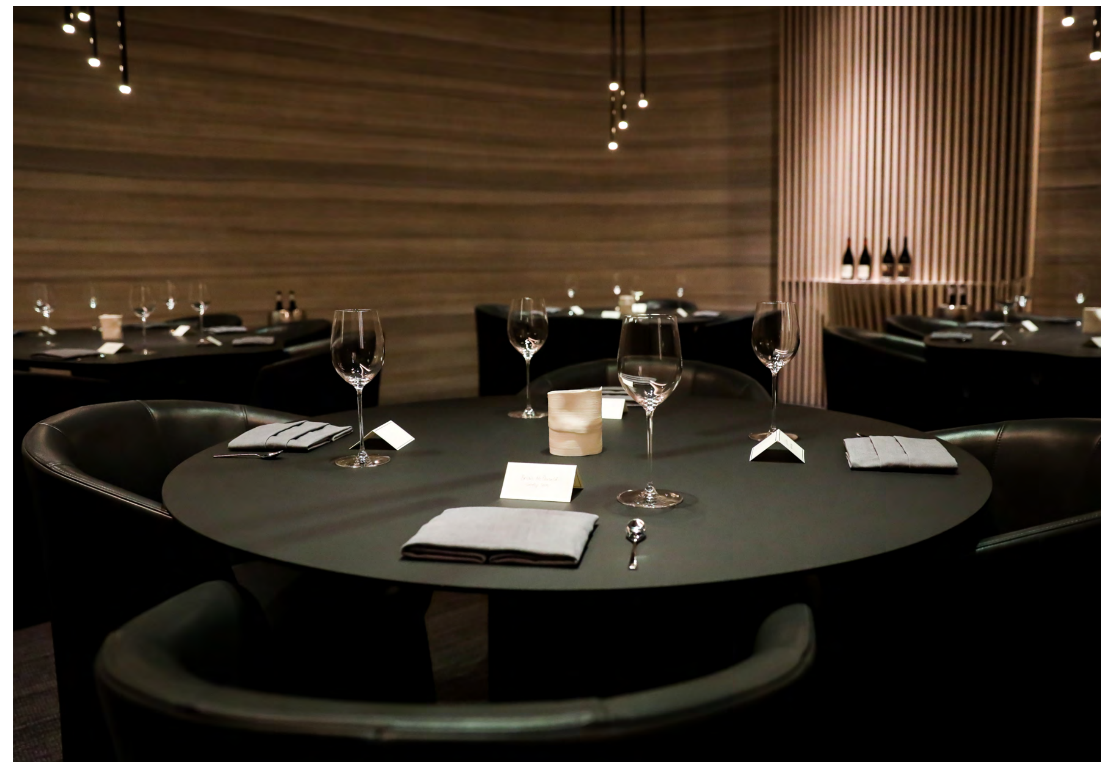
Dining Room 2