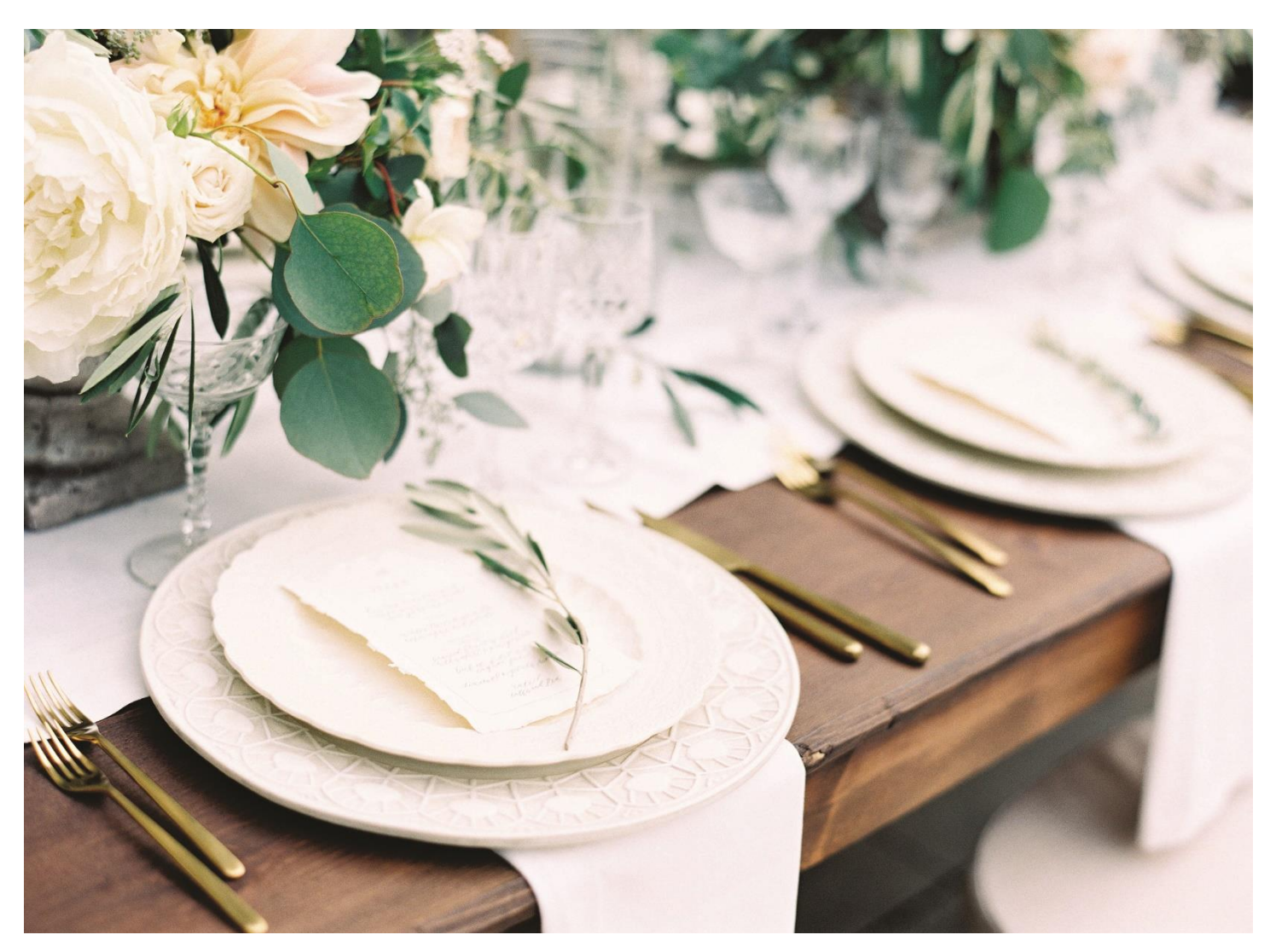
All menu prices are exclusive of 25% service charge and 7.75% tax.

910 Broadway Circle, San Diego, CA 92101 www.westingaslamp.com