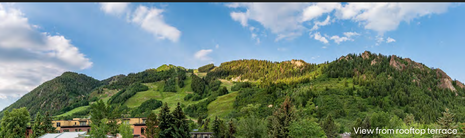
View from rooftop terrace