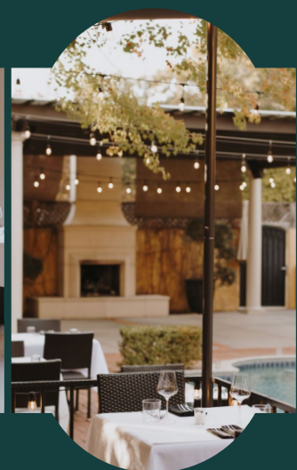
Outdoor Fireplace Max Capacity: 40