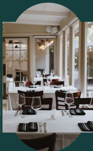
Garden Dining Room Max Capacity: 25