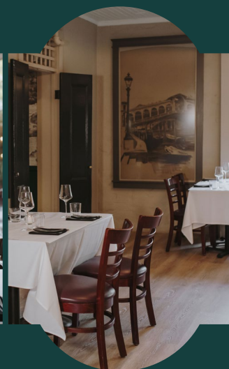
Main Dining Room Max Capacity: 40