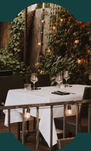
Terrace Max Capacity: 20

We are ideally suited for smaller engagements that benefit from the intimacy and top-end service that is found in an elevated dining experience. Choose to host your event in any of the unique spaces below.