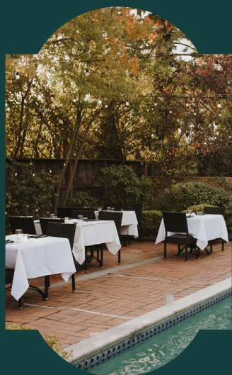
Courtyard Max Capacity: 65